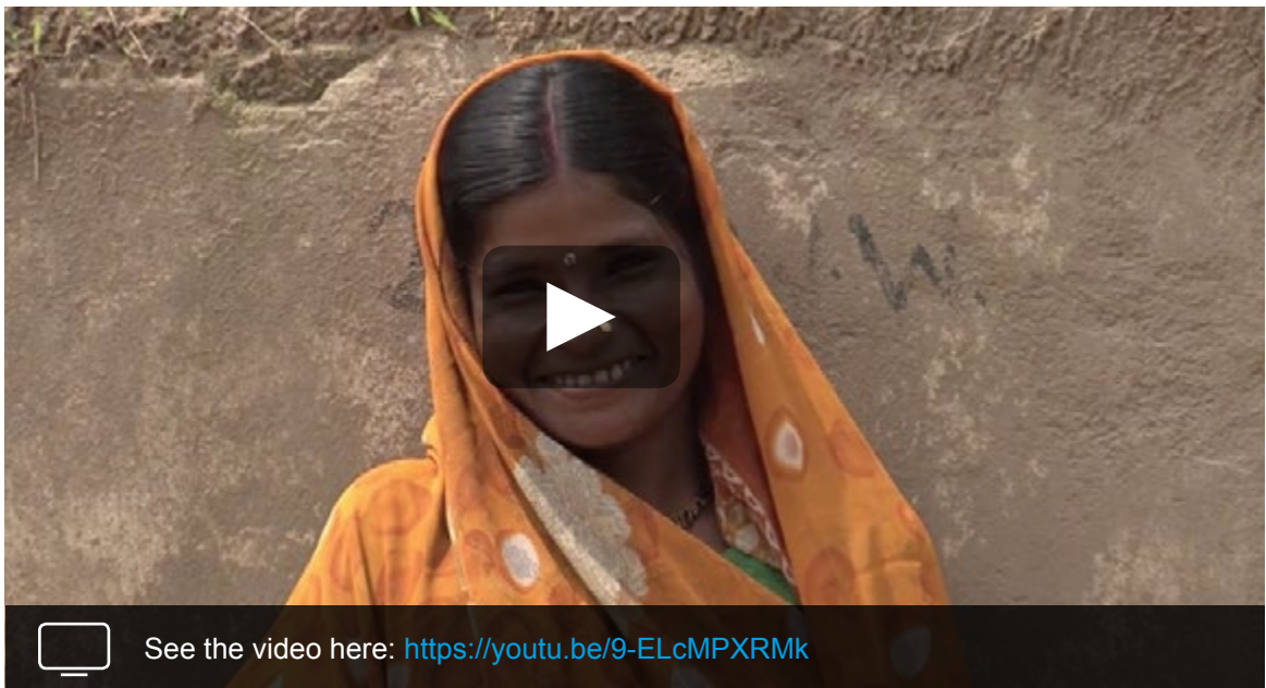
Greenpeace film on the battle to preserve the Mahan Forest

Instead, the government clamped down ruthlessly on those opposing coal, harassing Greenpeace activists, freezing its bank accounts and cancelling its status as an environmental NGO. They have also moved to try to weaken the FRA and other major environmental laws . 28