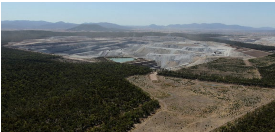
Anglesea opencut coal mine, Victoria.

“Coal is good for humanity, coal is good for prosperity, coal is an essential part of our economic future, here in Australia, and right around the world.”