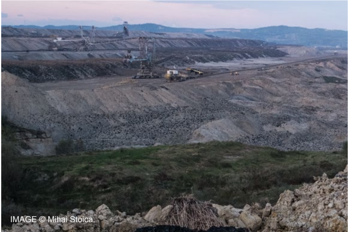
Mining threatens 1600 hectares of forest in Gorj County.

“Romanians are brothers to the forest,” old Romanian saying .