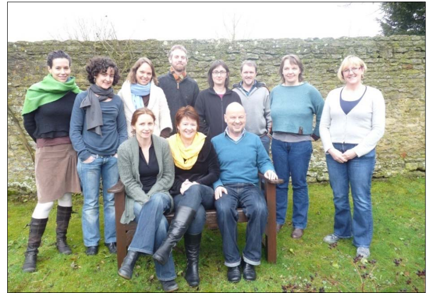
The FERN team, March 2010 (from left to right and back to front)