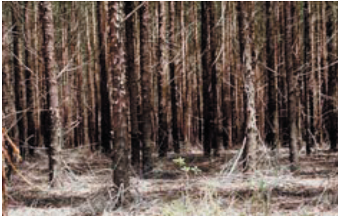
Figure 2: Proposed Plantar/World Bank Prototype Carbon Fund carbon 'offset' plantations in Brazil