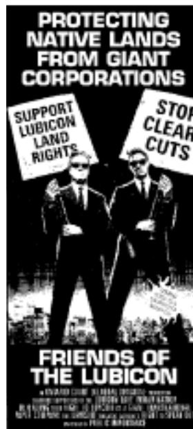
Friends of the Lubicon protests

Daishowa's plans to clear-cut Lubicon lands, the company constructed a huge pulp mill to use the timber, and in late 1990, started logging Lubicon land. After a request for help from the Lubicon, FOL launched a consumer boycott of Daishowa's paper bags in August 1991. The boycott was extremely successful: by the end of 1994, 47 companies representing over 4,300 retail outlets all over Canada had committed not to use the bags. Similar boycotts were also organised by other groups in Canada and Europe.