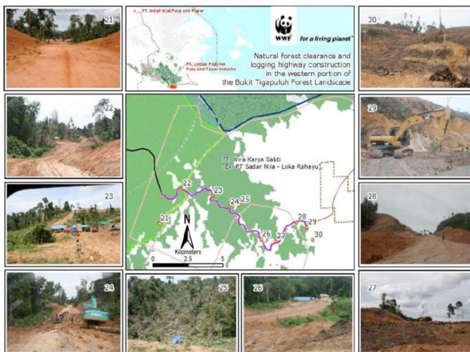
Map 7: Natural forest clearance in a concession of PT Wira Karya Sakti, APP’s associated company in Jambi and logging highway construction in the southern portion of the Bukit Tigapuluh Forest Landscape. The natural forest clearcutting by PT Wira Karya Sakti is on a concession that holds a license, but the company is also clearcutting and constructing a logging road beyond the license granted by the government. Inset map shows a logging highway between the APP pulp mills in Riau and Jambi.

The report found that APP-associated companies had logged native forest ‘without proper professional assessments or stakeholder consultation and sometimes even with proper licenses.’ 59 PT WKS were logging in part of a proposed Specific Protected Area 60 – an area where orangutans had recently been re-introduced. The report documents the destruction to the forest in detail through maps and photographs. Photographs show bulldozers clearing forests, and piles of woodchips and acacia trees planted next to piles of logs. In each case, companies associated with APP are responsible. 61